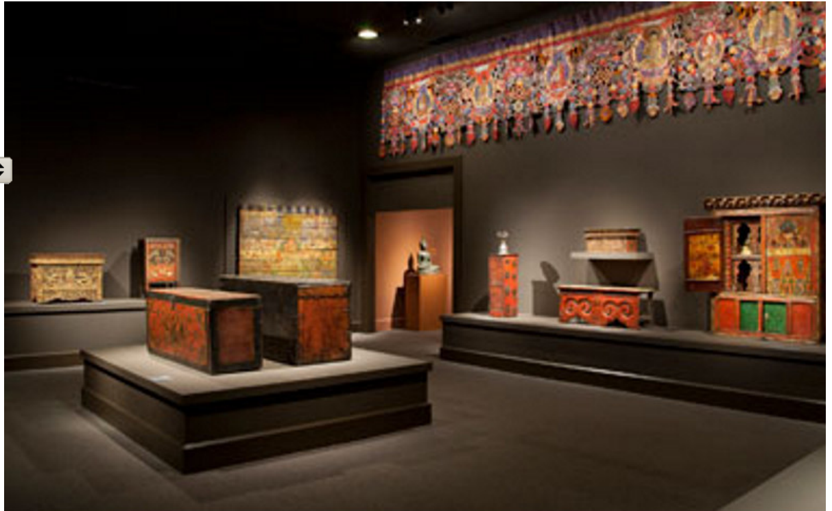
The Hayward Family Collection of Tibetan Furniture. The Hayward Collection contains 39 masterpieces of virtually every important type of Tibetan furniture, dating from the late 12th to 20th centuries. Tibetan furniture was typically made for Buddhist monasteries and house holds, and features vibrant colors and ornamentation. With this acquisition, LACMA's collection of Tibetan and Nepalese art has been elevated to the world's most comprehensive public collection.

LOS ANGELES, CA.- This weekend was the museum's 25th annual Collectors Committee event, in which a group of generous donors pool their resources to purchase works for LACMA's collection. Curators from nearly every department present artworks they'd like to see added to the permanent collection, giving short presentations on the objects' background and also temporarily installing the works in one of our galleries. After careful consideration, the Collectors Committee members—there were about 160 this year—come together for a gala dinner and vote on which artworks to acquire. The voting is over when the pool of funds is exhausted.