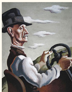
Thomas Hart Benton (1889-1975), The Yankee Driver, 1923. Oil on canvas, 26 x 23 1/4 in.

See more art on the AKN Flickr Gallery... Click Here!