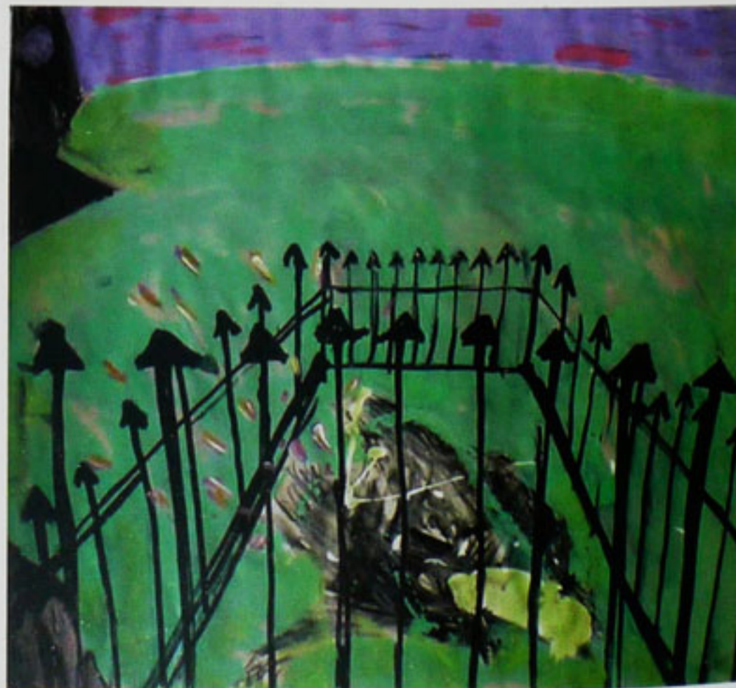
right Untitled , 2008 Oil on cardboard 50 x 65 cm

Adambakan is first and foremost a painter, working typically in oils, although he has also worked in other media such as fresco. His paintings cover a wide range of subjects – sometimes figures, sometimes elements of architecture, more recently landscapes – though the forms are often blurred and partially obscured by the expressionistic brushwork; indeed, some of his works even border on the abstract. What unites them, however, is a love of shimmering colour.