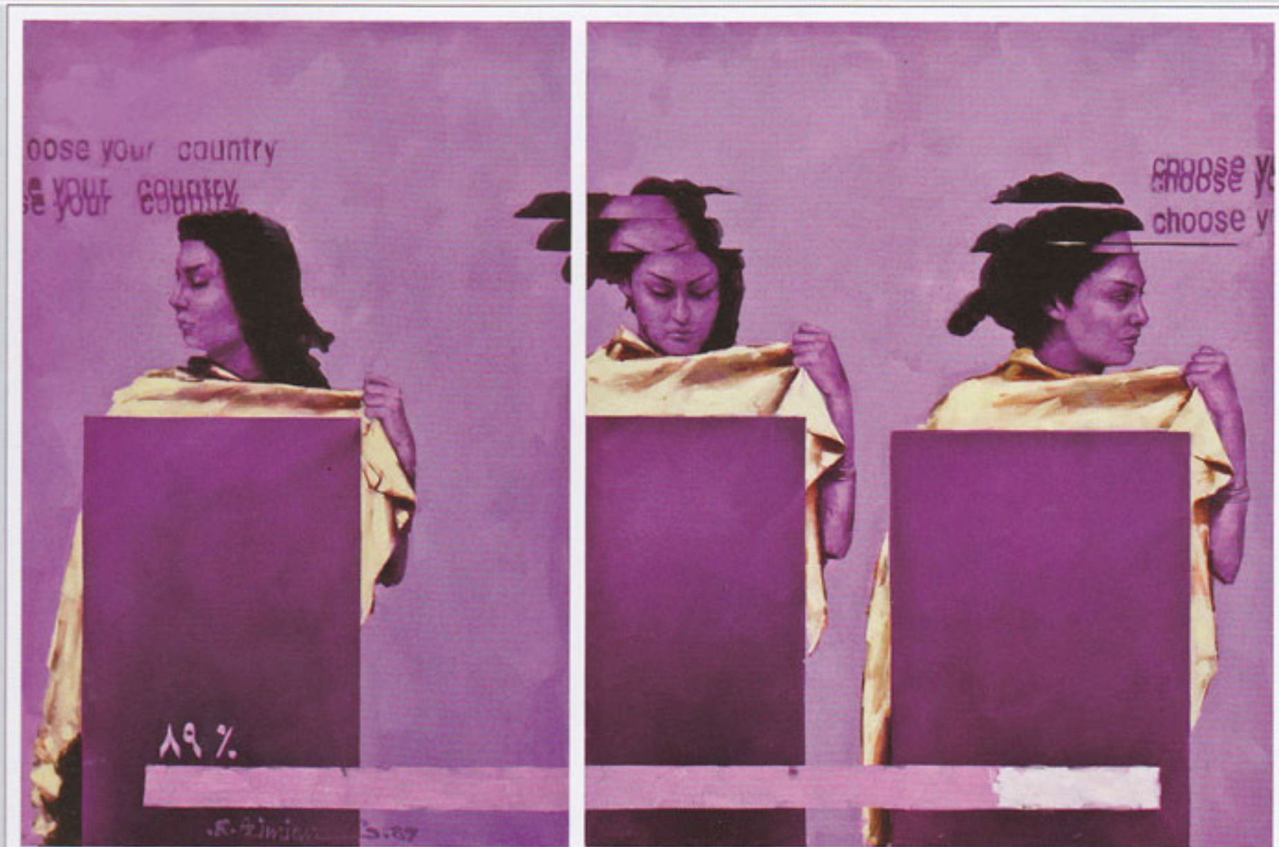
Choose Your Country / Download Series / 2010 / Oil on canvas / Diptych 110 x 180 cm