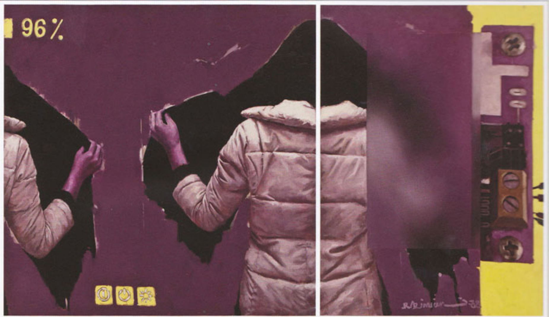
Standby / Download Series / 2010 / Oil on canvas / Diptych 180 x 310 cm